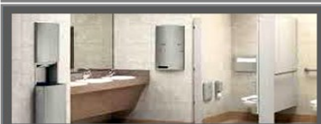
Toilet Partitions & Accessories