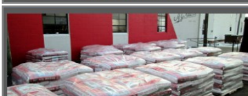
Ice Melt & Water Softener Salt